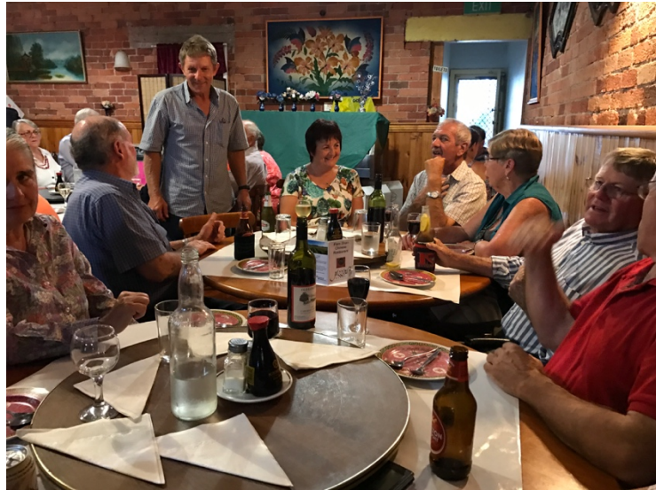
Rotary Club of Euroa members enjoy our social occasions.