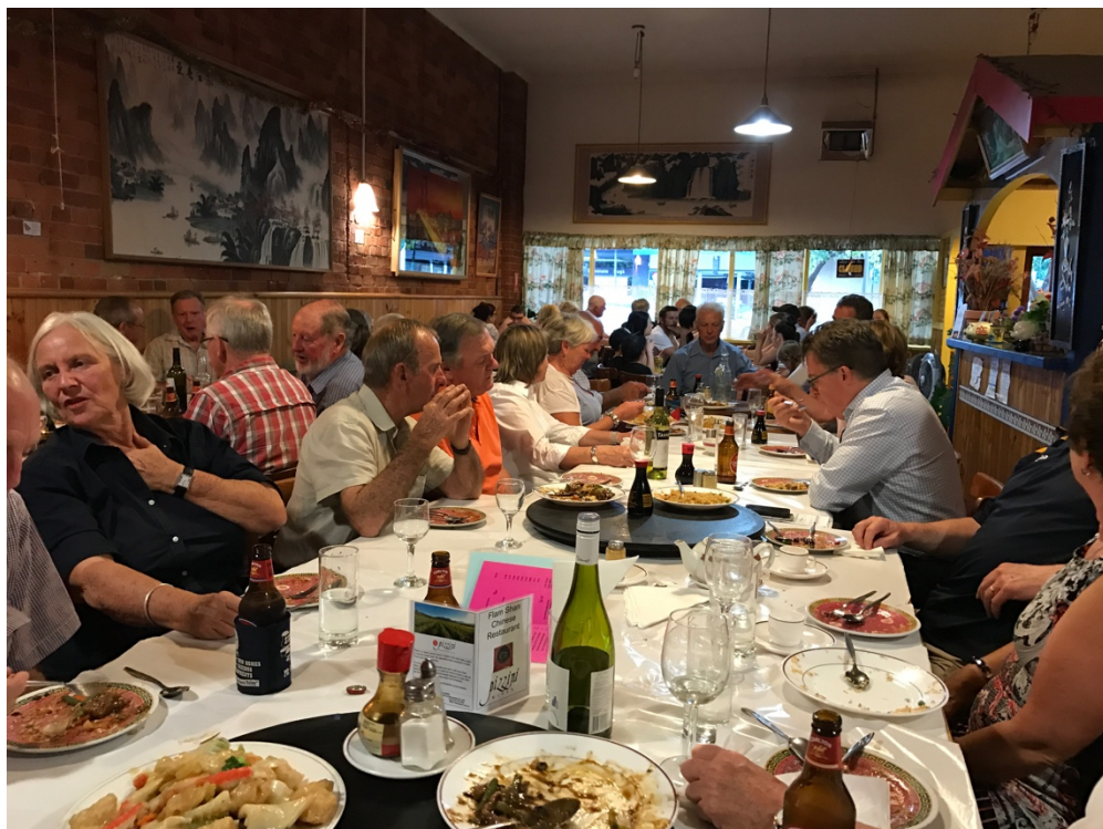
40 Rotarians and partners enjoyed the dinner at the Flan Sham on Thursday night, good food and great fellowship.

See you all back at the Golf Club on February 2 nd .