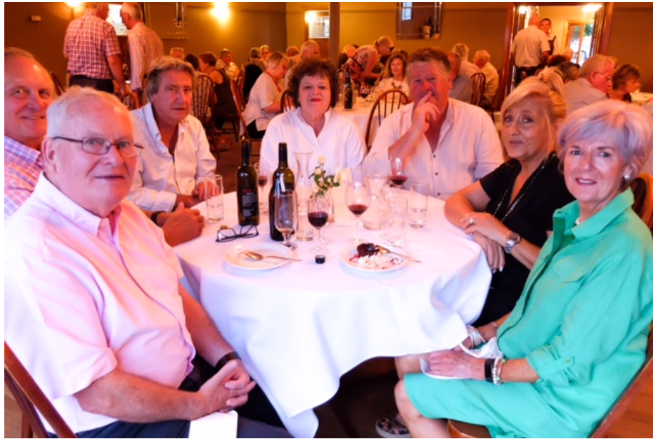
Pictured: Owners of the open gardens were guests of the club