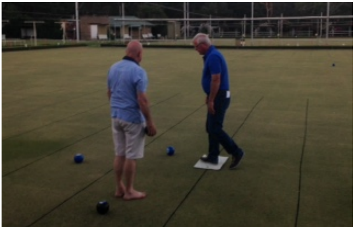
Some serious tactics being discussed here.