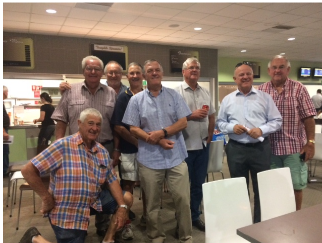
A fun night was had by all who attended, not a great deal of money was made!