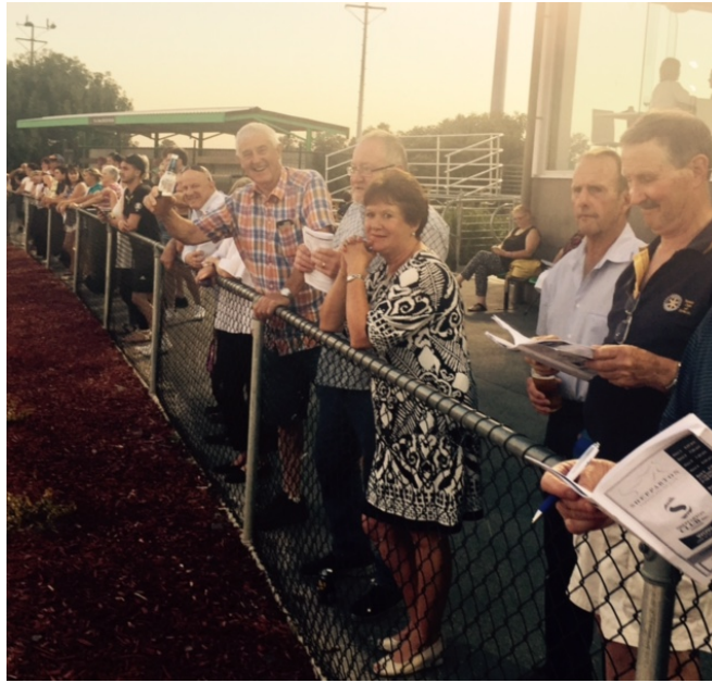
President Bill has the following caption for this photo: The Euroa Investment Club