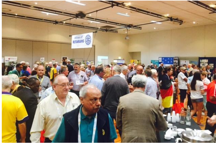
Conference goes enjoying morning tea