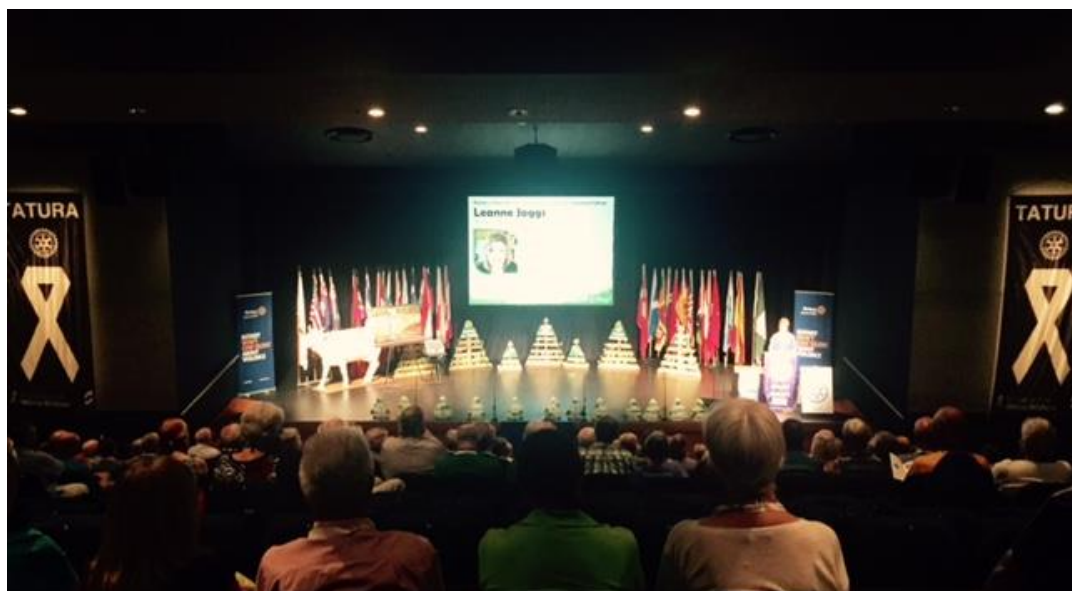
Conference stage in Shepparton