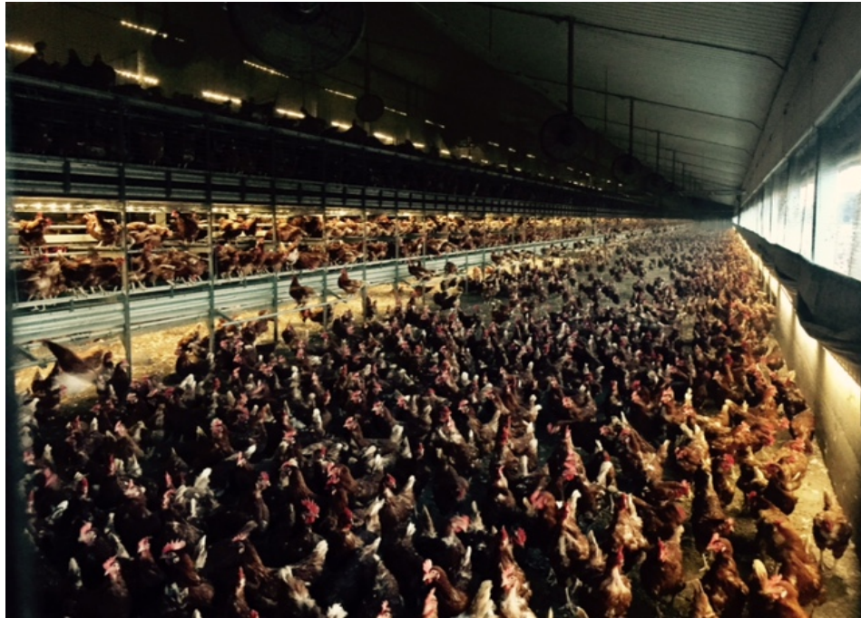
Chickens as far as the eye can see!