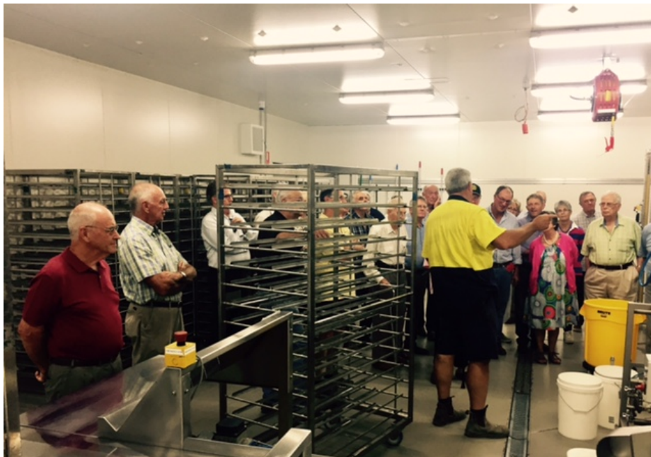
Our tour guide explains the production and operation at Kinross.